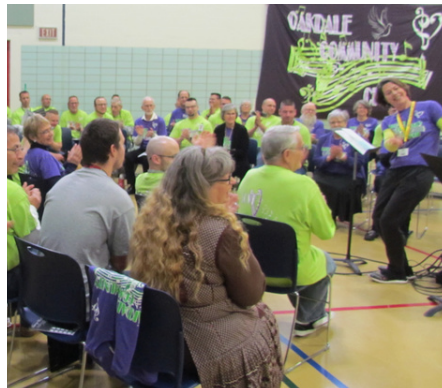
The Oakdale Community Choir