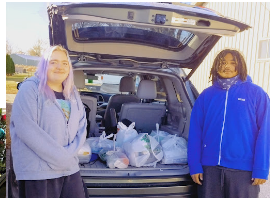
Iowa Big Alburnett Schools

individuals received 31-day and/or 10-ride bus passes