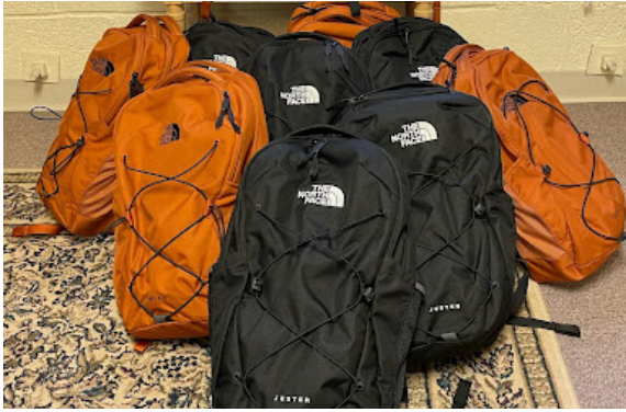
First Mennonite Church

An overlooked key necessity to successful reentry is access to personal care items. Inside Out provides backpacks filled with items to members upon release from incarceration. In 2022, IO provided 77 backpacks to members in need - more than double the number of backpacks provided in 2021! We couldn't have met that need without donations from Iowa Big Alburnett Schools, First Mennonite Church of Iowa City, New Song Church , and individual donations. If you are interested in donating, please visit our Amazon Wish List here: https://a.co/3CAU1qU , or by shopping locally.