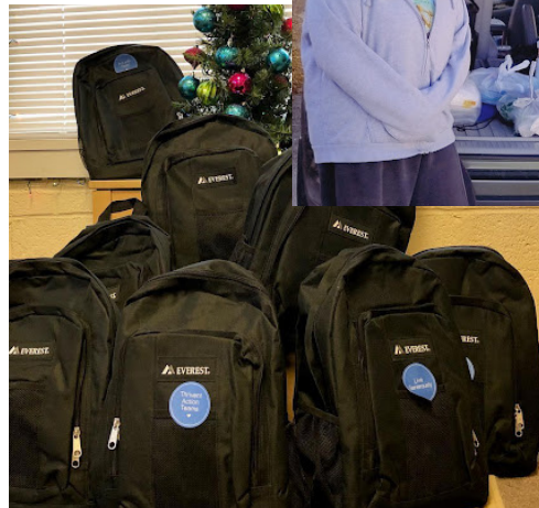
New Song Church